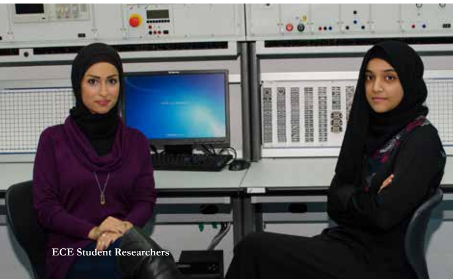
ECE Student Researchers

Over the past two years, AUK engineering students have produced 12 refereed conference publications and 12 short papers, abstracts, and posters for regional and international conferences, including the IEEE-GCC, IEEE Canadian Conference on Electrical and Computer Engineering (CCECE), and The IEEE/TRB International Conference on Connected Vehicles & Expo. In 2015, AUK student representatives won two best poster presentation awards at the Undergraduate Research Conference, in Dubai, UAE, and received three awards for capstone projects exhibited in events and competitions in Kuwait during the IEEE Women in Engineering event and the first Workshop on Assistive Robotics. ★