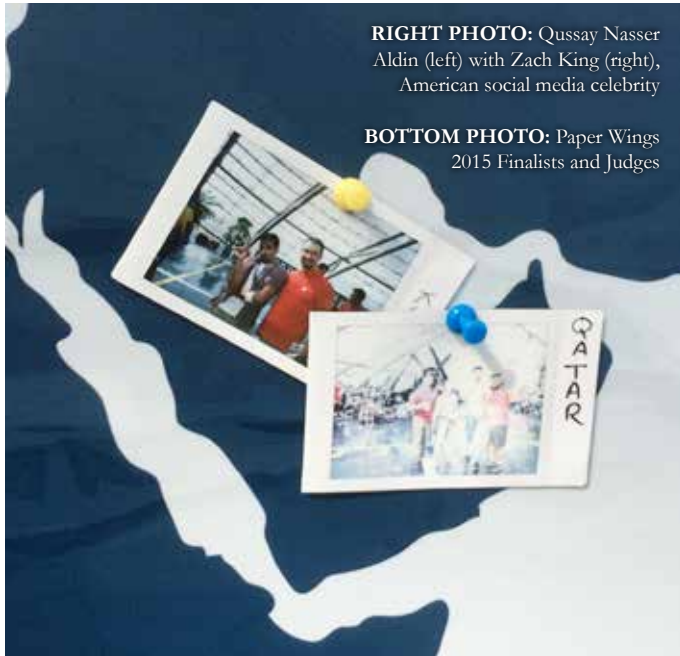
BOTTOM PHOTO: Paper Wings 2015 Finalists and Judges